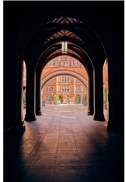
Marlow Business School - London

By attracting and retaining top talent, organisations can harness the full potential of their workforce, driving organisational growth and resilience in the face of emerging technologies and market disruptions. Overall, the programme equips CTOs with the tools and knowledge needed to lead high-performance teams, navigate complex challenges, and propel their organisations to new heights of success.